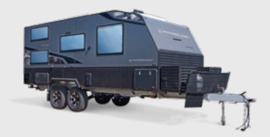
Front and road side