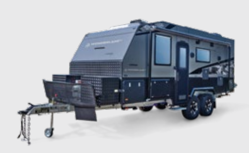
Front and door side